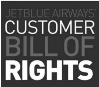
Fig. 3 for Question 3

JetBlue is dedicated to making every part of your experience as simple and pleasant as possible. Unfortunately, there are times when things do not go as planned. If you are inconvenienced as a result, we think it is important that you know exactly what you can expect from us. That's why we created our Customer Bill of Rights. These Rights will always be subject to the highest level of safety and security for our customers and crew members.